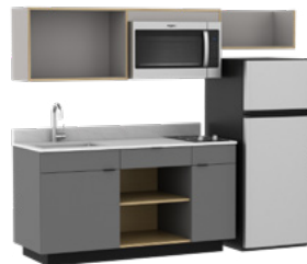
X-222R-U, X-222R-B, X-222R-STN KITCHENETTE (RIGHT) 90"W X 24.5"D X 74"H