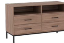
X-297 DRESSER 60"W X 22"D X 34"H