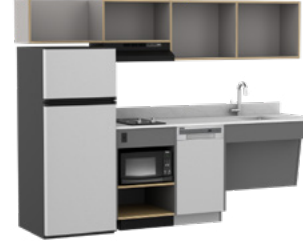
X-222ACCL-U, X-222ACCL-BOPT, X-222ACCL-STN ACC KITCHENETTE W/DISHWASHER (LEFT) 100"W X 24.5"D X 74"H