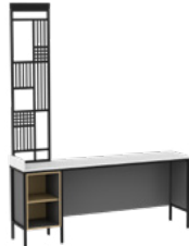
X-220, X-220-STN, X-220.1-SCRN ISLAND DESK 82"W X 18"D X 106.25"H