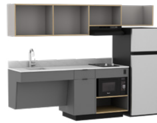
X-222ACCR-U, X-222ACCR-B, X-222ACCR-STN ACC KITCHENETTE (RIGHT) 100"W X 24.5"D X 74"H