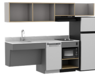
X-222ACCR-U, X-222ACCR-BOPT, X-222ACCR-STN ACC KITCHENETTE W/DISHWASHER (RIGHT) 100"W X 24.5"D X 74"H