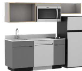
X-222R-U, X-222R-BOPT, X-222R-STN KITCHENETTE W/DISHWASHER (RIGHT) 90"W X 24.5"D X 74"H