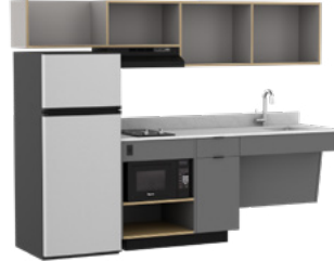
X-222ACCL-U, X-222ACCL-B, X-222ACCL-STN ACC KITCHENETTE (LEFT) 100"W X 24.5"D X 74"H