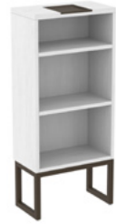
X-221 STORAGE CUBBY 18"W X 10"D X 41"H