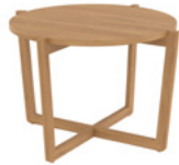
X-224 COCKTAIL TABLE 32"W X 32"D X 20"H