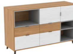
X-296 DRESSER 66"W X 20"D X 40"H