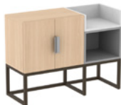
X-284 SMALL TV CABINET 40"W X 15"D X 30"H