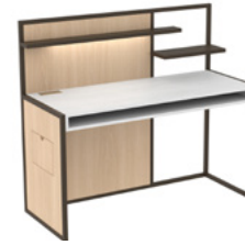
X-272L DESK 55.5"W X 23"D X 49"H