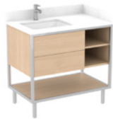
X-223L VANITY 36.5"W X 22.5"D X 34"H