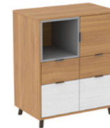
X-281 DRESSER 33"W X 20"D X 40"H