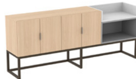
X-297 LARGE TV CABINET 72"W X 15"D X 30"H