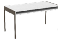
X-291 TABLE DINING-DESK 60"W X 30"D X 31"H