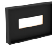
X-226 TV PANEL 32"W X 4"D X 21"H