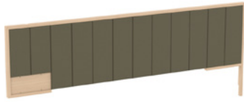
K-209L-ACC ADA KING HEADBOARD 109"W X 2"D X 42"H