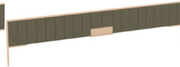
QQ-209 DOUBLE QUEEN HEADBOARD 190"W X 2"D X 42"H