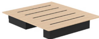
K-211L KING PLATFORM 72"W X 82"D X 14"H