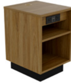
VAL.008 16" NIGHTSTAND (WITH 1 POWER/2 USB) 16"W X 18"D X 24"H