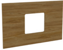
VAL.002 MEDIA WALL PANEL 48"W X 3"D X 30"H