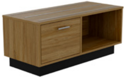
VAL.006 LUGGAGE BENCH 42"W X 18"D X 18"H