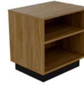
VAL.009 24" NIGHTSTAND 24"W X 18"D X 24"H