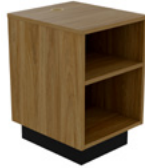
VAL.007 16" NIGHTSTAND 16"W X 18"D X 24"H