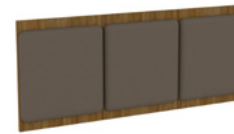
VAL.014 QUEEN HEADBOARD (UPHOLSTERED) 66"W X 2"D X 24"H