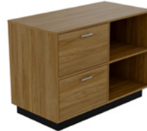
VAL.004 CREDENZA 48"W X 22"D X 36"H