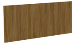
VAL.013 QUEEN HEADBOARD 66"W X 1"D X 24"H