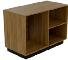
VAL.003 MICROFRIDGE UNIT 48"W X 22"D X 36"H