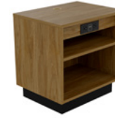
VAL.010 24" NIGHTSTAND (WITH 1 POWER/2 USB) 24"W X 18"D X 24"H