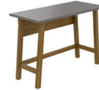
VAL.005 WORKSTATION 42"W X 19"D X 30"H